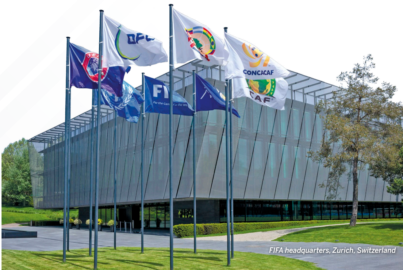
FIFA headquarters, Zurich, Switzerland